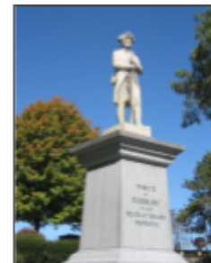
at 329 Concord Road

Please see the next page for information about our next production.