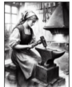
image of a 19th century blacksmith

represented on our float by a leather apron