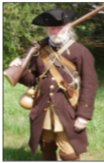
reenactor dressed as a member of the Militia